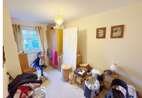
Bedroom One 11'6" x 10'2" (3.53m x 3.12m)